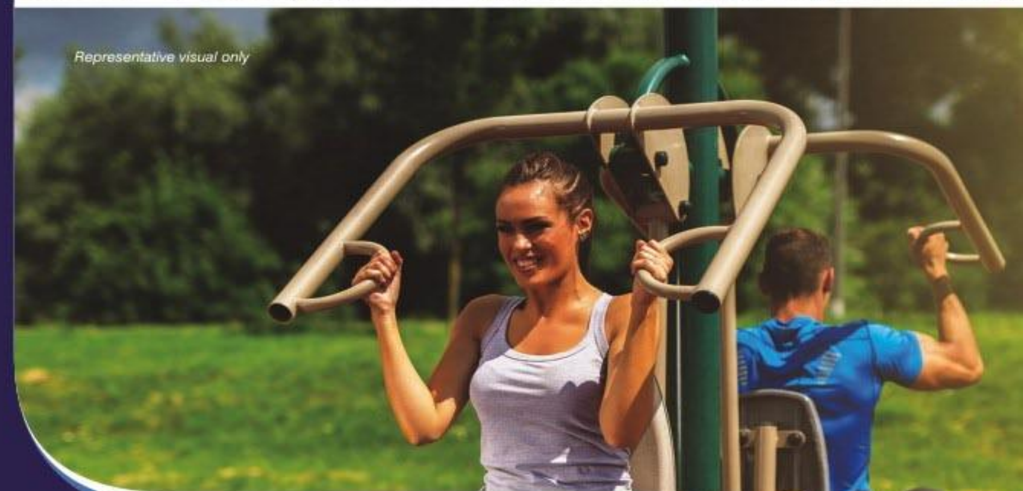
Representative visual only