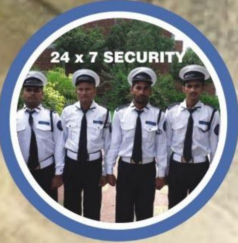
24 x 7 SECURITY