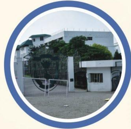
DELHI PUBLIC SCHOOL (300 Metres)