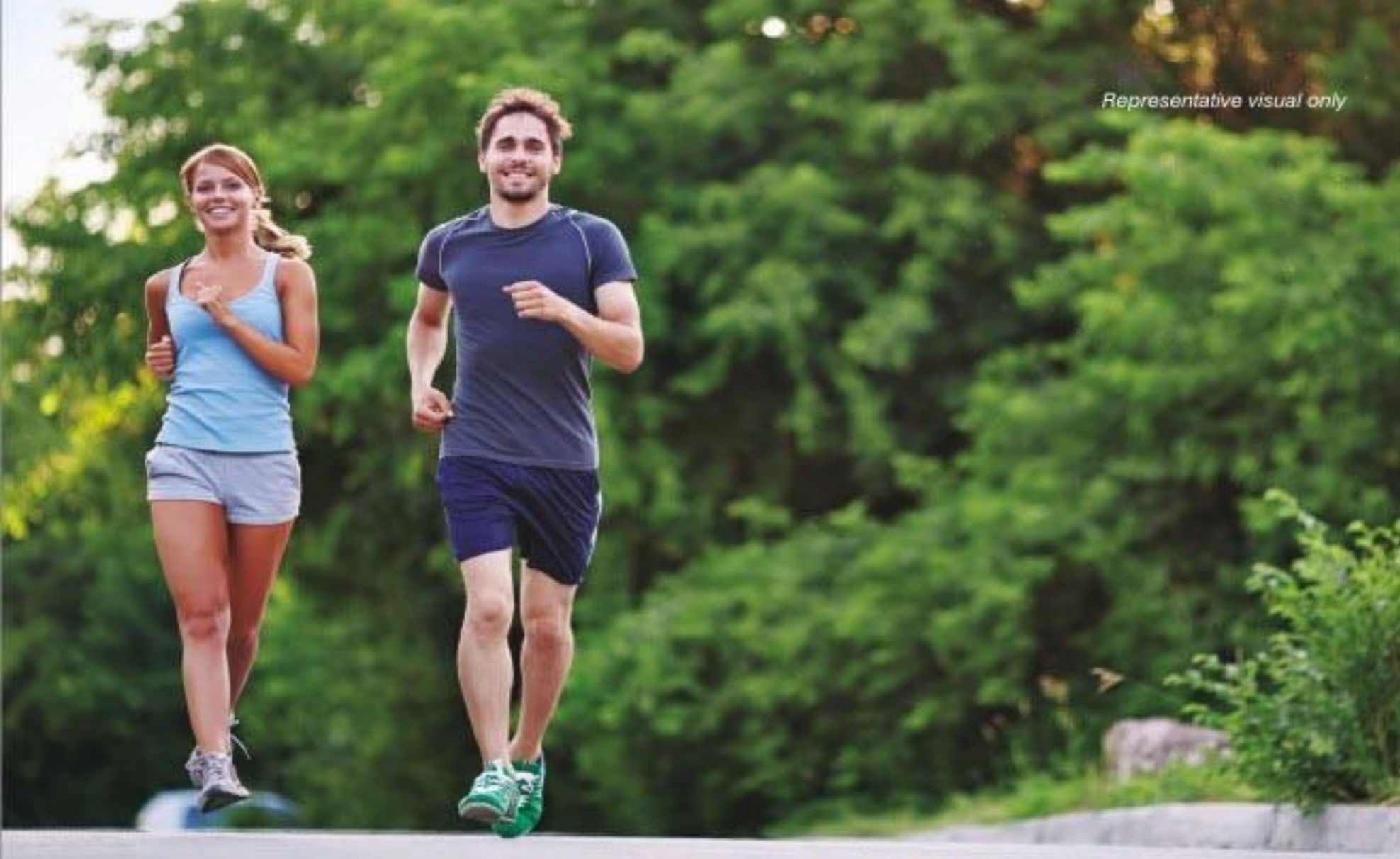
Representative visual only