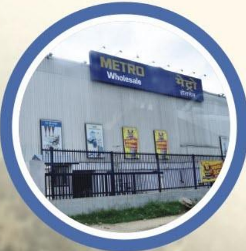
METRO WHOLESALE (450 Metres)