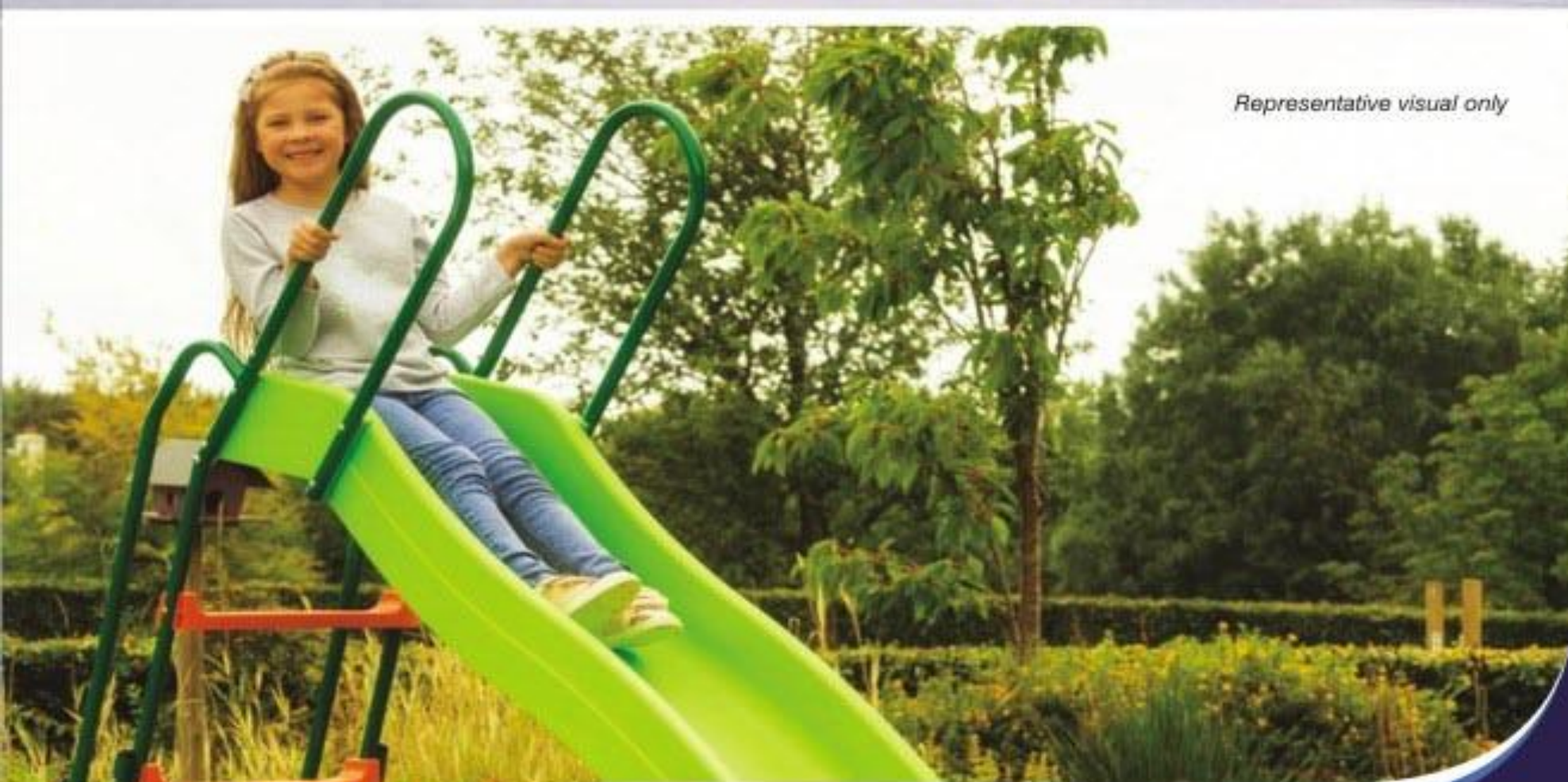
Representative visual only